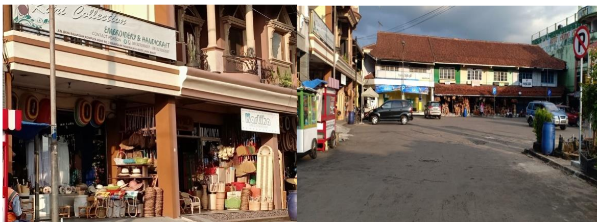
Figure 1. Shop selling pandan woven products in Rajapolah District